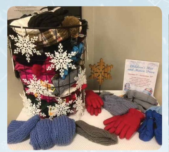
Collected and donated children's hats and mittens to the Ladies Auxiliary of the Bristol Fire Department to be handed out to help keep children warm this winter season.

We love giving back to our communities especially during the holday season. We would not be able to accomplish any of it without the support and generosity from our staff and members!