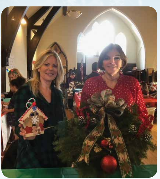
Volunteered at the 36th Annual Bristol Christmas Festival.