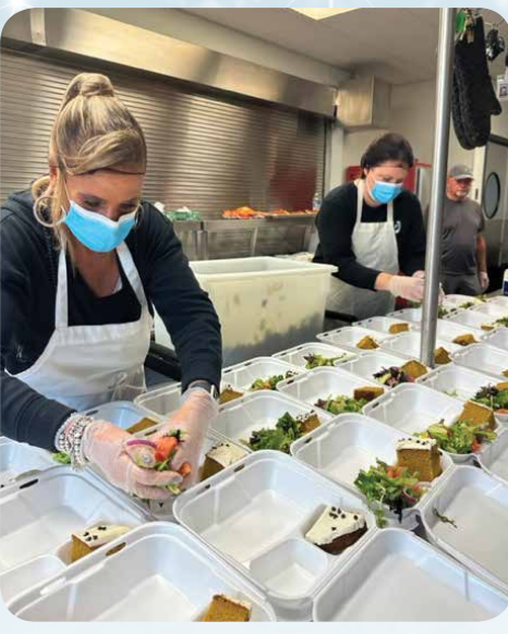
Volunteered at Amos House preparing and distributing meals to those in need.