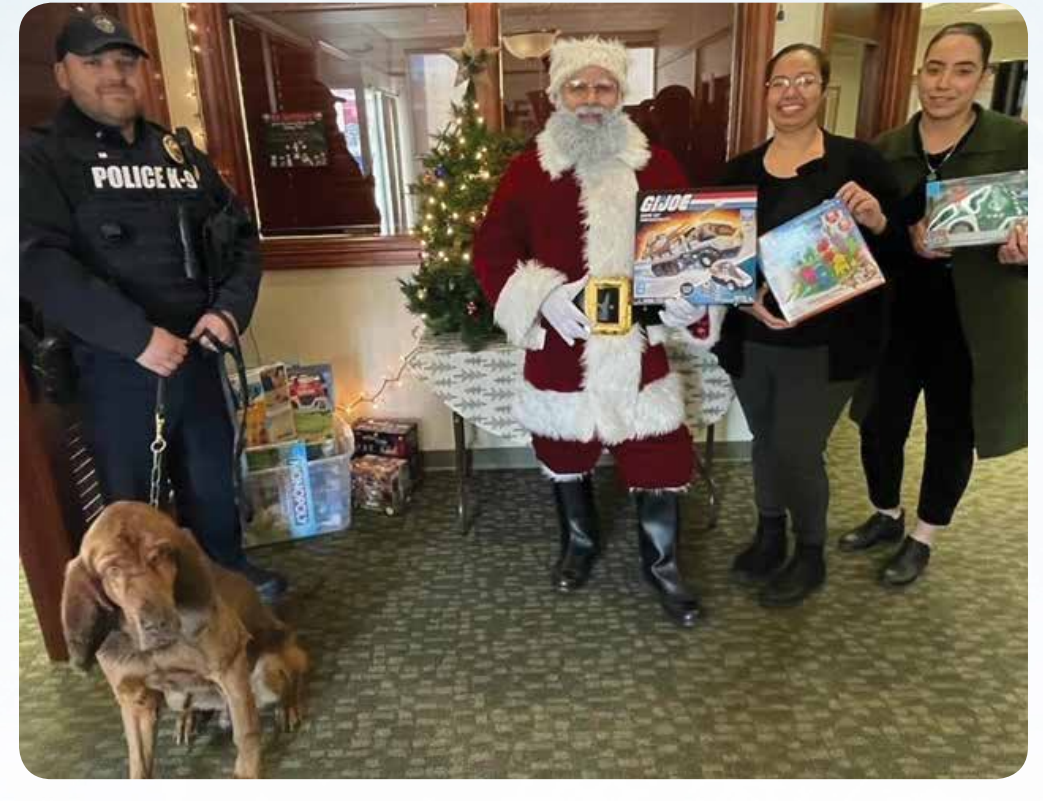
Partnered with the Pawtucket Police Department by collecting toys in our Pawtucket Branch for the Annual K9s for Kids Holiday Party!