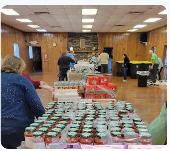
Supported the Burrillville Weekend Snack Pack Program with a donation and volunteers to help pack food.