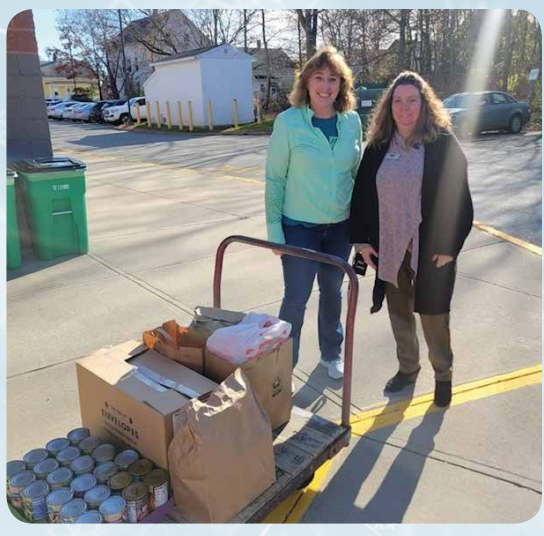
Collected food to support food pantries and soup kitchens.