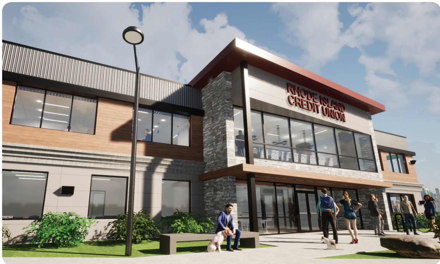
ARCHITECTURAL RENDERING OF THE BUILDING.

I am excited to announce that we have purchased the building located at 95 Jefferson Boulevard in Warwick to serve as our new Headquarters and Operations Center. The two-story 28,000 square foot facility will meet the future needs of our growing organization. The current structure will undergo major renovations designed to optimize workplace efficiency and provide an overall better work environment for our staff. Our Headquarters and Operations Center will include creative spaces, attractive surroundings, and collaborative work areas to engage staff while also fostering an atmosphere that encourages staff fulfillment and therefore, delivering a better member experience.